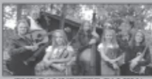
THE BANKSTER FAMILY Saturday Evening/Sunday