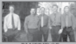
BLUERIDGE Friday (2 Shows)