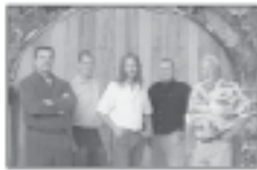
NOTHIN' FANCY Friday (2 Shows)