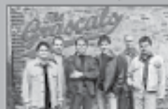
THE GRASCALS Saturday