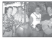
DRY BRANCH FIRE SQUAD Saturday/Sunday